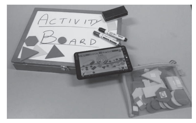
Figure 1. The MultiActivity Board, MAB

The system architecture includes: i) RFID antenna ANT_HF_310 X 180 (Antenna HF 310mm x 180mm), ii) RFID reader BlueRFID HF<sup>1</sup>, iii) Main controller (with RX/TX module USB/Wi-Fi) with a Particle Photon (a tiny, reprogrammable Wi-Fi development kit for prototyping)<sup>2</sup>, a STM32F205 120Mhz ARM Cortex M3 and Cypress BCM43362 Wi-Fi chip (Single band 2.4GHz IEEE 802.11b/g/n), iv) battery module equipped with MCP73831 for LiPo charging and a MAX1704X for fuel gauging<sup>3</sup> and a LiPo Battery 3000mAh (Di Fuccio et al., 2017).