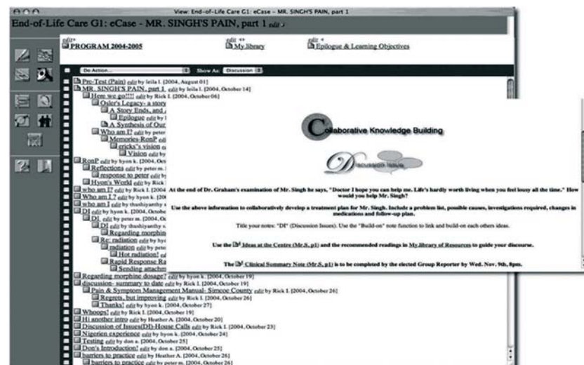
Figure 5. Collaborative knowledge building discourse