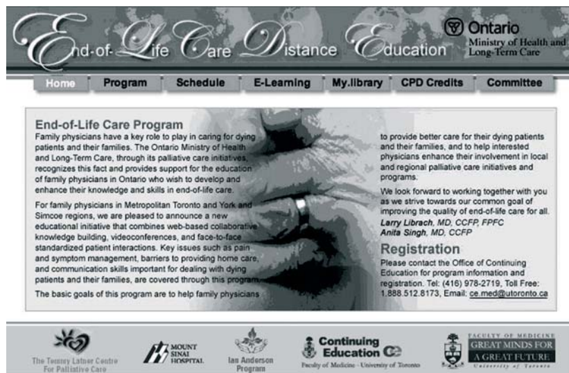
Figure 1. The End-of-Life Care Distance Education Program of the Ontario Ministry of Health and Long-Term Care, a continuing professional development course for family physicians